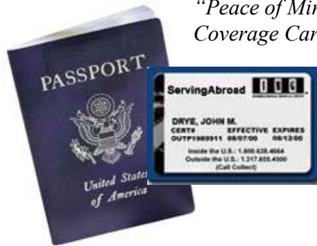
"Peace of Mind" Coverage Card